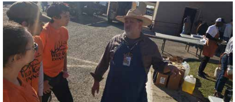
Students in the DRHS Culinary program helped prepare food at the Chamber of Commerce's Annual Wild Game Dinner. Students used culinary skills learned in class to prepare guisado made from deer meat for the attendees. They helped to cook 300lbs of deer meet that was said to be delicious! Students also made over 140 cakes and items for the annual Monster Mash and other local community events. Students learn and use valuable skills and gain community service experience.