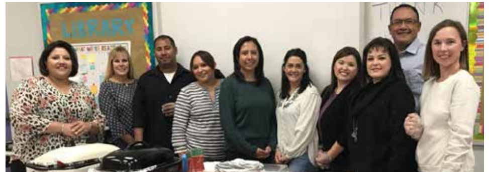
Parent volunteers at San Felipe Memorial Middle School treated all teachers and staff to lunch on Monday, December 2nd. SFMMS would like to extend a huge thank you to our parent volunteers for the kind gesture of treating the entire staff to lunch.