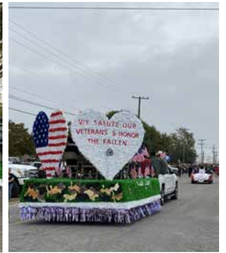
Blended Academy honors our military veterans and the fallen with a parade float. Students expressed that it is always rewarding to see veterans clapping and cheering when they see the float.