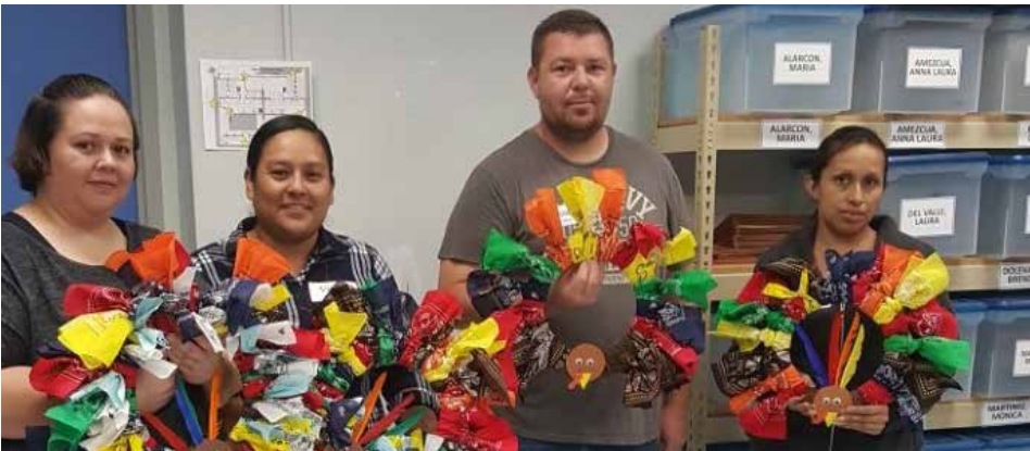
Parents at San Felipe Memorial Middle School participated in a make-and-take activity. Parents created their own Christmas wreaths.