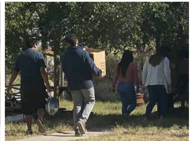
BASAA assisted The San Felipe Lions with the delivery of Thanksgiving baskets during the break on November 26, 2019. They also arranged sponsors for families.