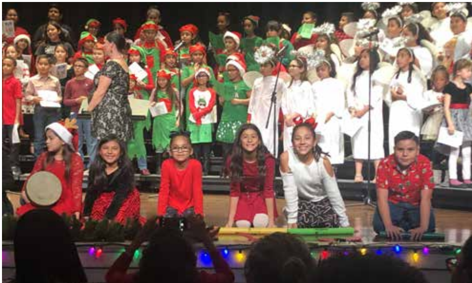
The Elementary Choirs had their District Choir Concert on Thursday, December 5th. All the students sounded wonderful and the concert was a complete success.