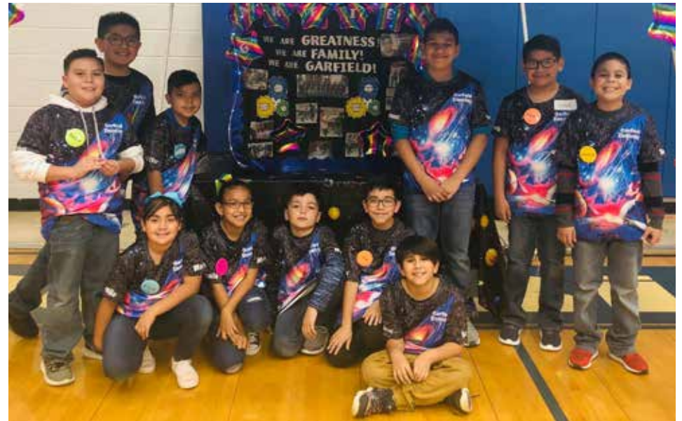
The Garfield Robotics team gathered around their pit for a picture.