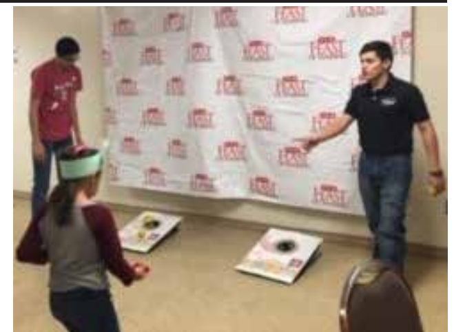
Members of FCCLA Ram Chapter helped organize the Children's Activities Event as part of this year's HEB Feast of Sharing. Members informed local children about leadership opportunities, taught about being thankful, organized crafts and games, and worked alongside members of local student organizations from Del Rio High School. Members from NTHS, NHS, FBLA, FCCLA Culinary, HOSA, Student Council, ROTC all helped HEB have a successful event. Members met local civic leaders and learned about being responsible community members.