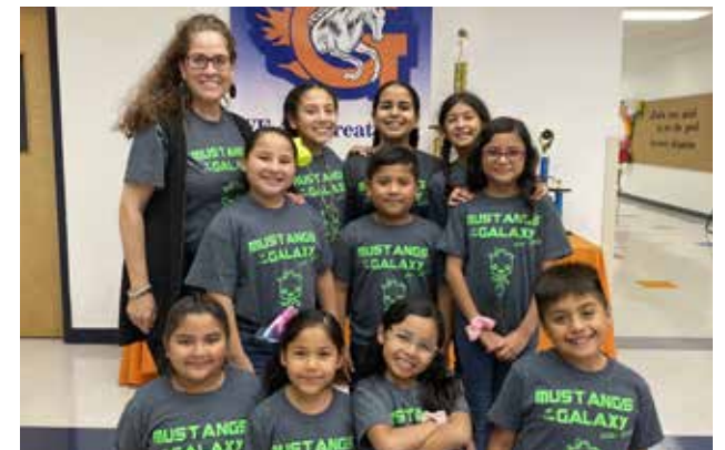
Garfield Elementary Mustangs UIL Ready Writing team is pictured. Students represent 3rd, 4th, and 5th grade. Way to Go, Garfield, we're very proud of you!