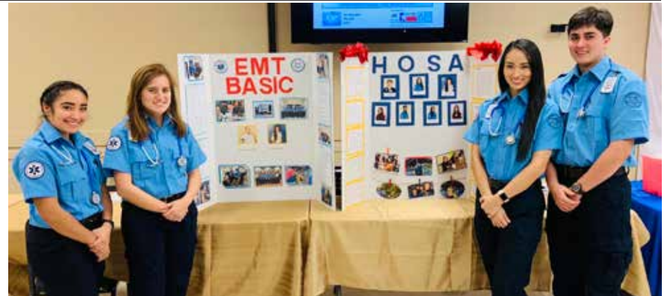
November 14th marked the annual World Diabetes Day and DRHS CTE EMT students were invited to participate in the SWTJC diabetes fair. Students participated in sharing diabetes facts, healthy eating, and provided blood glucose readings.