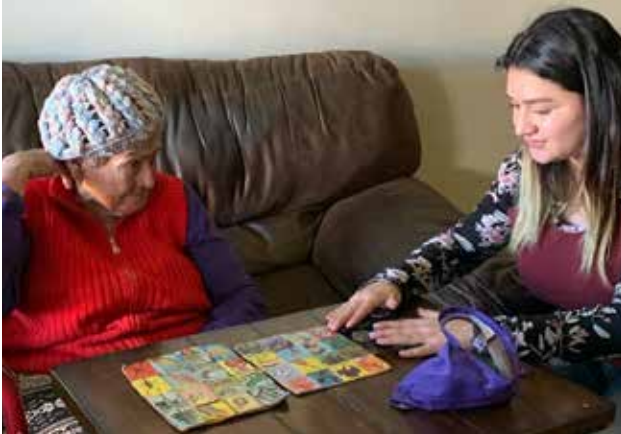
Bingo buddies! BASAA continues to bring smiles to Roswell residents. Students host monthly bingos with the residents.