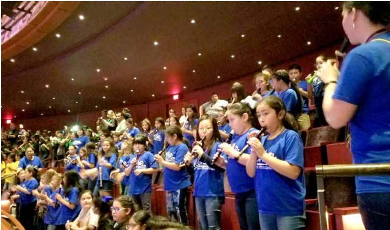
On May 22nd the BV Longhorn Choir and Art Academy traveled to San Antonio, TX to perform at the Tobin Center with the San Antonio Symphony. After performing to the program "The Orchestra Rocks" students enjoyed eating and playing at Incredible Pizza. Great job, students and teachers. All your hard work paid off!