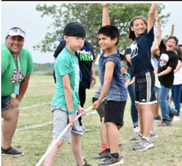
Teamwork is what it is all about! This year's Fitness Finally was a hit!