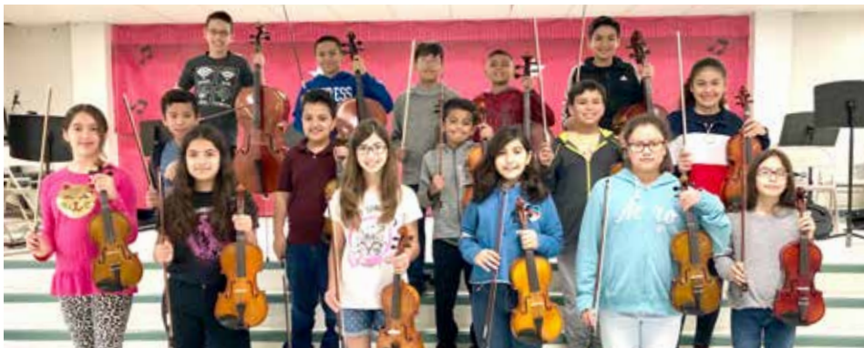
Strings students have been working hard all year long. Great Job, Panthers!