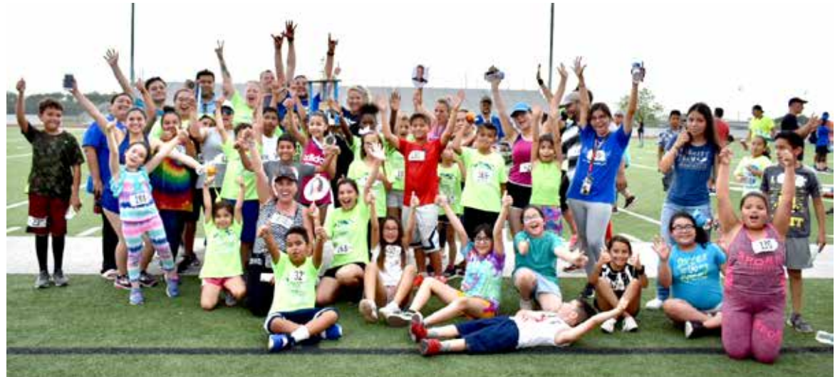
Teachers felt the love and support of their students and parents at this year's I Love My Teacher 5k!