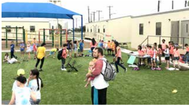
First Annual Fun Day at Roberto "Bobby" Barrera Elementary STEM Magnet School. The RBBE PTO and staff prepared a great day for the students.