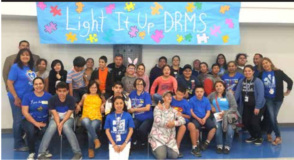
Del Rio Middle School was happy to celebrate Autism month in April with the involvement of students, staff and parents.