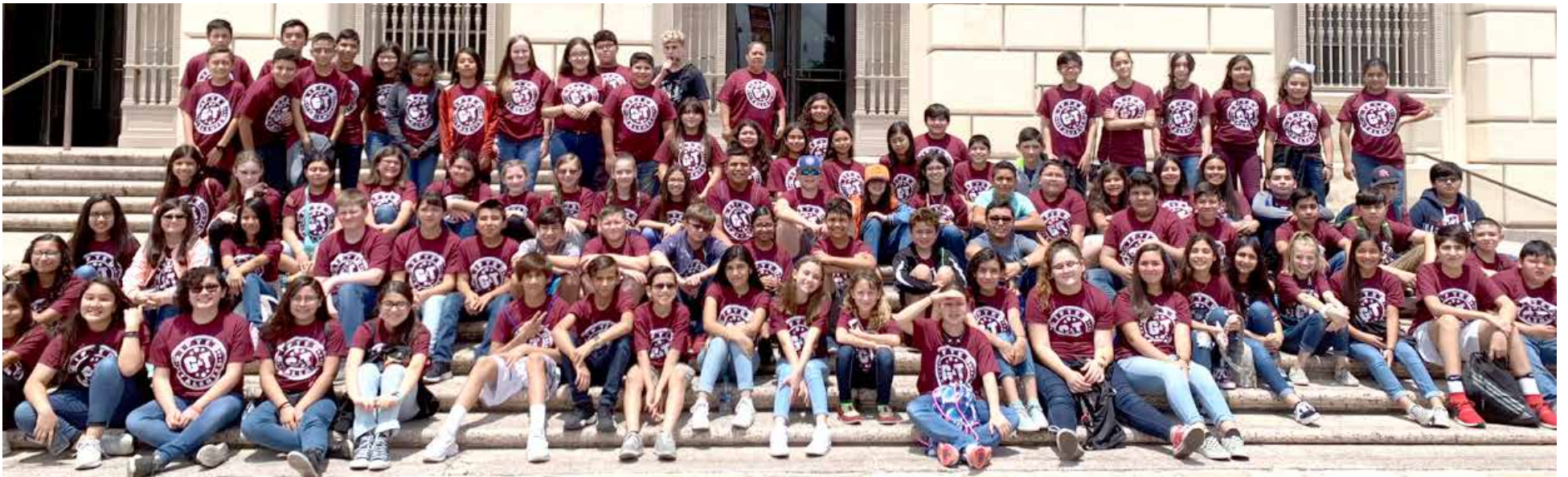
A group of GT students from San Felipe Memorial Middle School took a tour of the Alamo in San Antonio on Friday, May 24th as part of their end-of-year field trip.