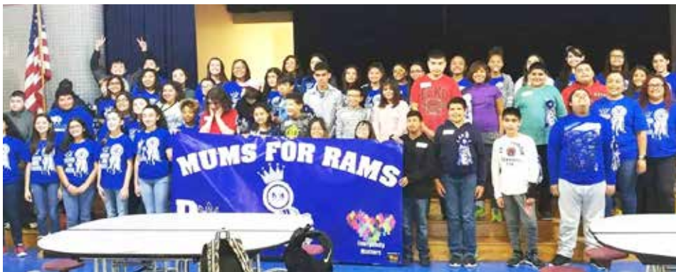
Thanks to the Education Foundation Grant, Mums for Rams was a success at Del Rio Middle School in promoting partnerships with all students.