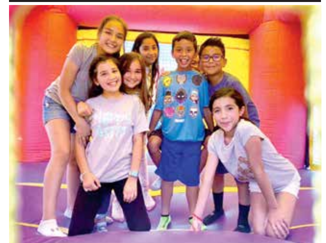
Panthers have worked extremely hard all year to have the highest attendance in the district! We have won the attendance trophy EVERY 6 WEEKS this year and we were treated to a Block Party for all to enjoy! Keep up the great work, Panthers!