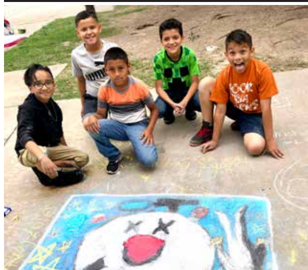
Chalk Fest 2019 was a huge success! Students were able to display their artwork for all to see. We sure do have some talented artist among us!