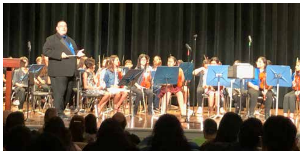
The San Felipe Memorial Middle School orchestra held their end-of-year concert on Tuesday, May 21st at district's Student Performance Center.