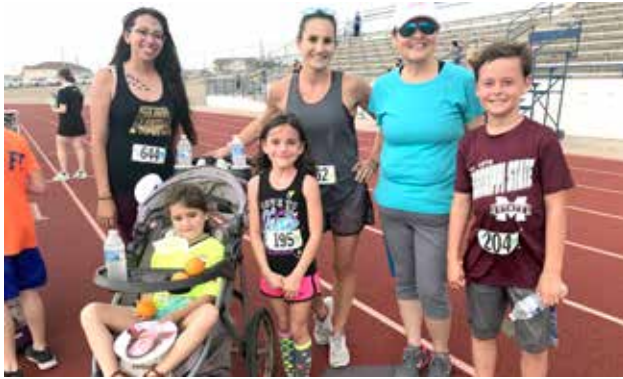
Students, teachers and parents came out to support the RBBE teachers at the I Love My Teacher 5K.