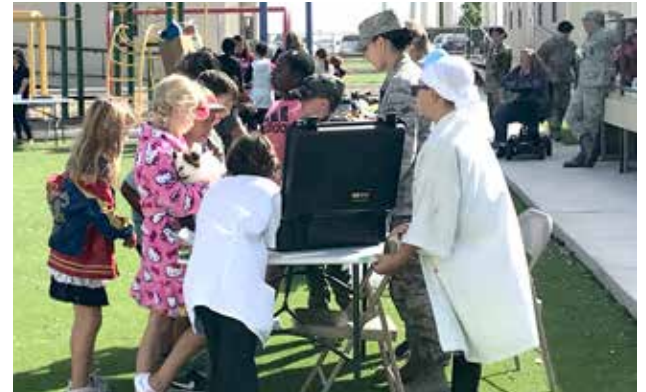
Career Day- LAFB and Del Rio organizations came out for RBBEs 1st annual Career Awareness Day.