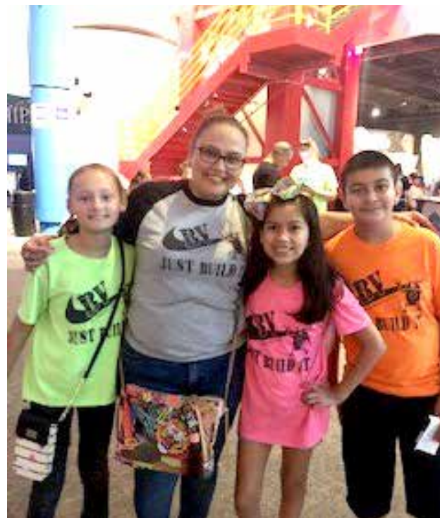
On May 21st Buena Vista's Robotic Team traveled all the way to NASA to learn about the space program. Students were able to tour Johnson Space Center, explore the museum and some even took virtual rides into space.