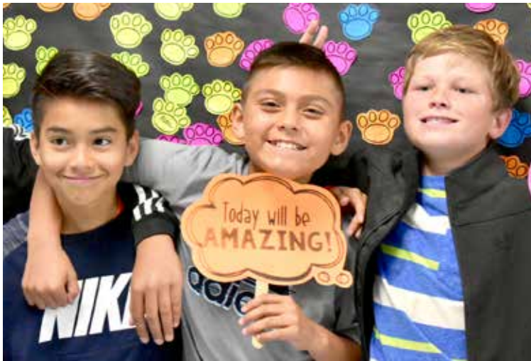
Students pledged to do their best on their upcoming STAAR tests! Go, Panthers!