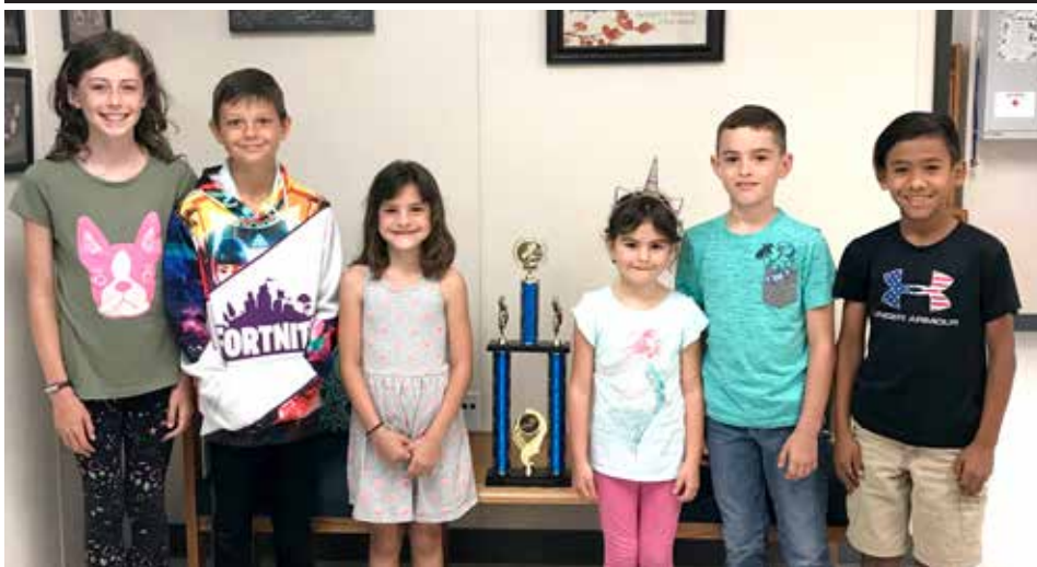
Roberto "Bobby" Barrera Elementary STEM Magnet School won 1st place at the Elementary Track Meet for Small School Participation, all students placing in their races.