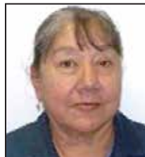
Maria D. Martinez