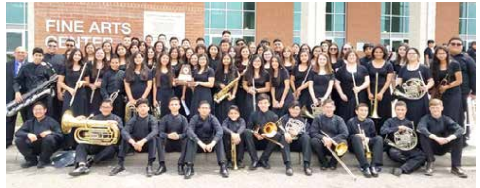
Del Rio Middle School Symphonic Band competed on April 16th in Eagle Pass, Texas and received a sweepstakes rating.