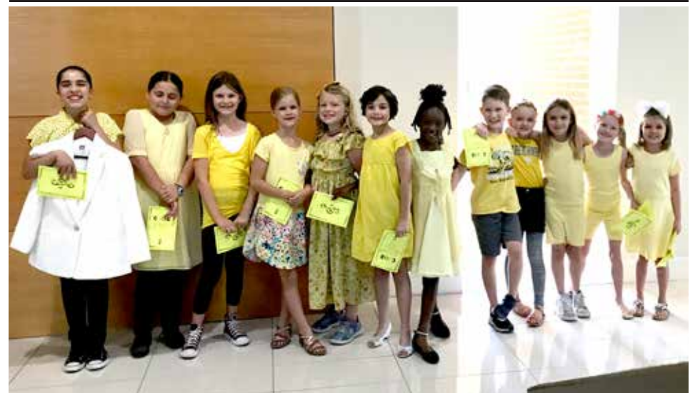
Roberto "Bobby" Barrera Elementary STEM Magnet School Choir performed Yellow Submarine at the Spring Concert.