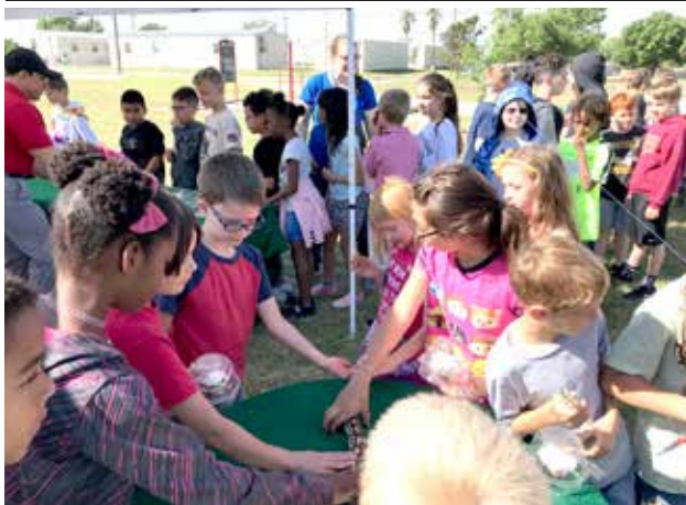
Earth Day- LAFB and RBBE celebrate Earth Day with a tree planting, local wildlife awareness and preservation information.