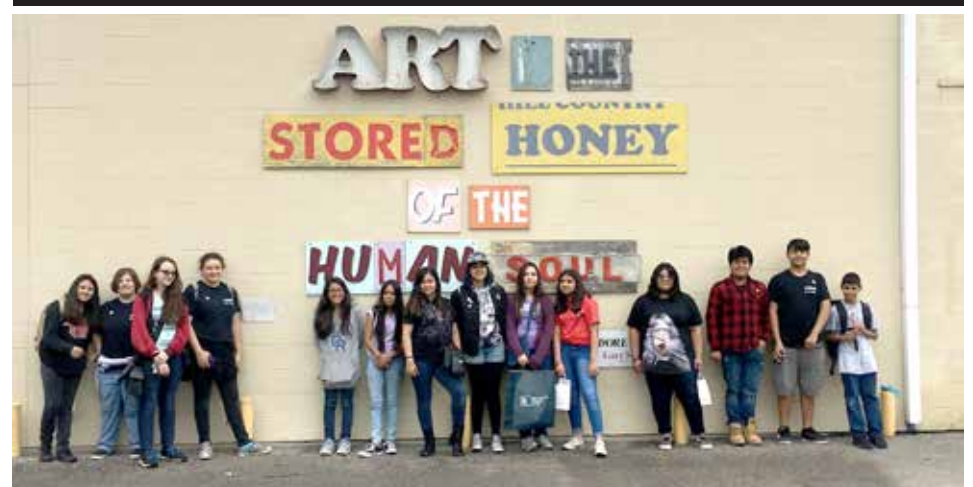
The Del Rio Middle School Art Club attended a field trip in San Antonio, Texas on May 18th. They visited the San Antonio Art Museum and San Antonio Central Library.