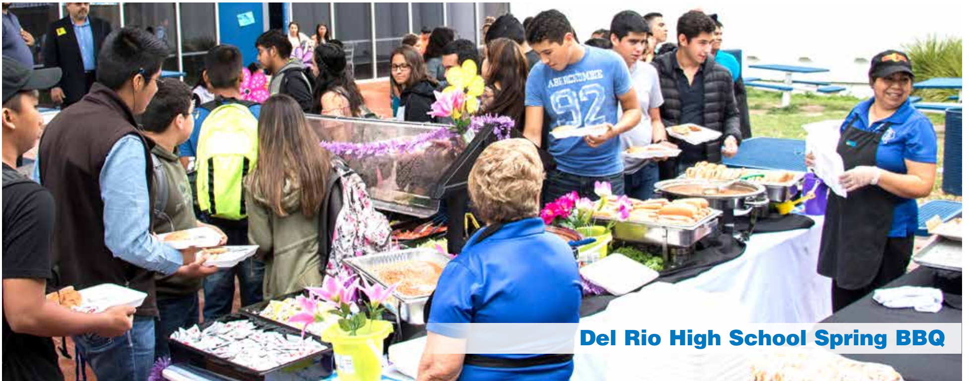
Del Rio High School Spring BBQ