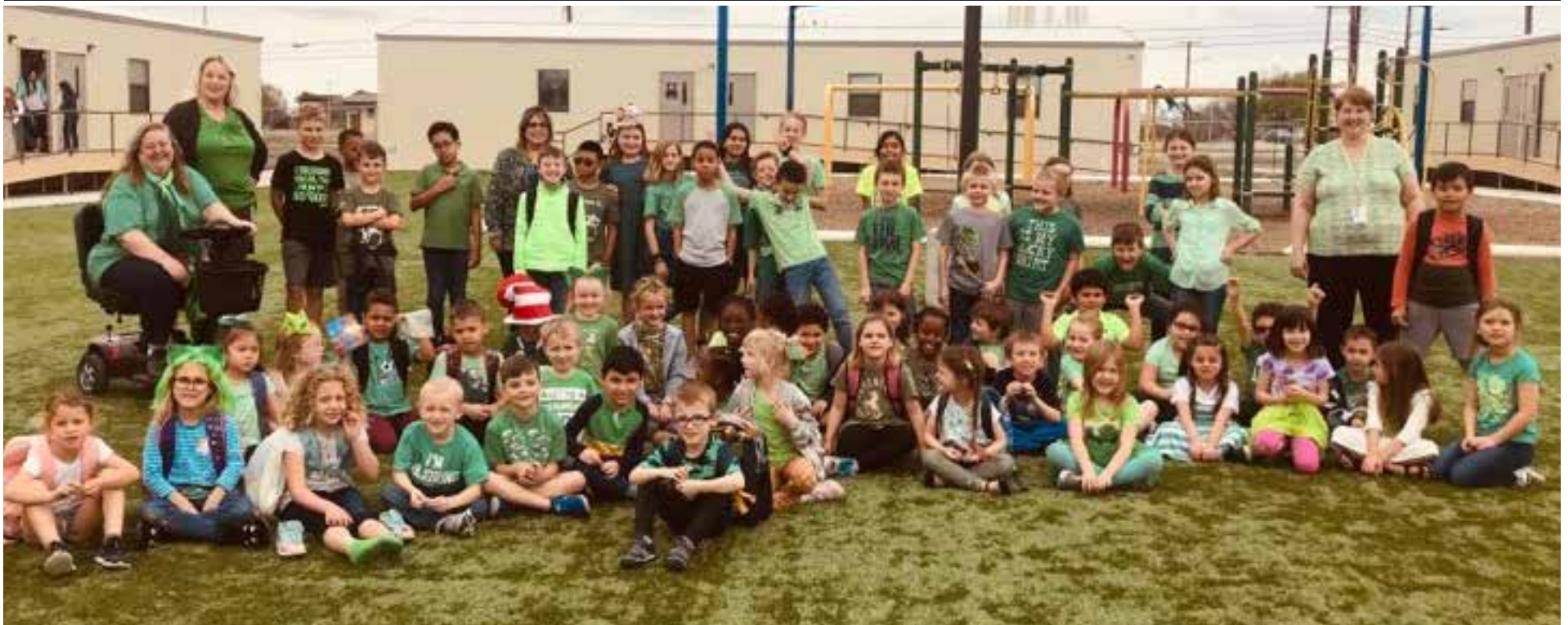
Staff and students wear their green to show their love for this delightful book!