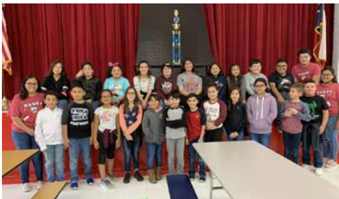
FCCLA students get together with NHE Student Council and give a presentation about how technology affects many things. The FCCLA students planned team building activities to engage students in conversation with each other to show how technology does not have to be part of their daily life. The student council members enjoyed the evening and will invite them again.