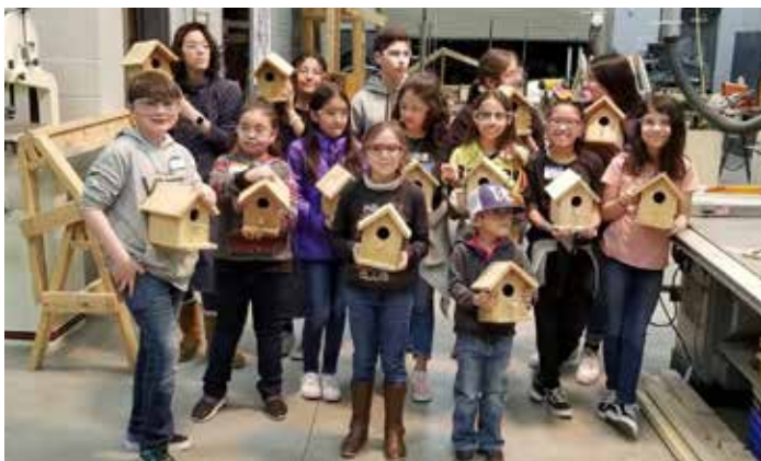
5th grade NHE STEM members construct a bird house at the Career and Technical Education Do-It-Yourself Night.