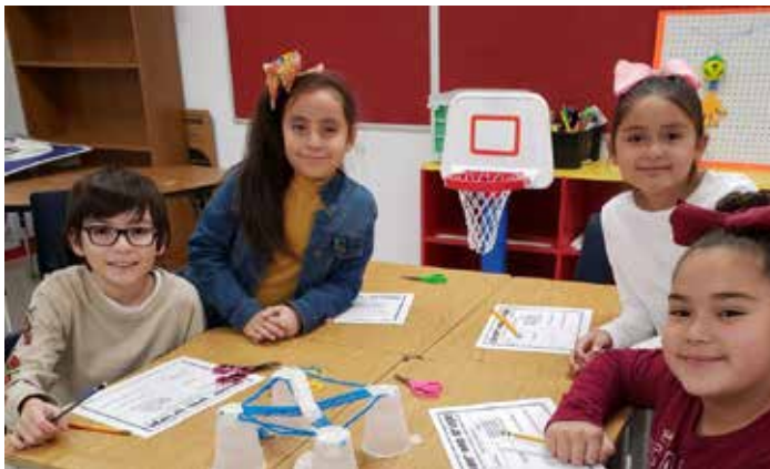
3rd grade NHE STEM members create a Spider Web Bridge using yarn, cups and tape. They win the challenge!