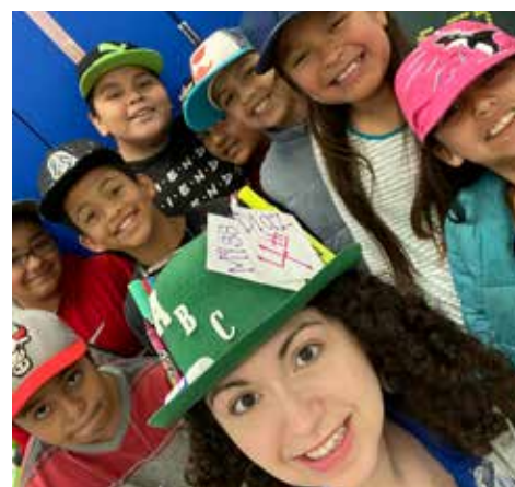
Ms. Diaz's 4th grade class is all smiles as they show their school spirit on National Hat Day. They all posed for a quick picture with all of their different hats.