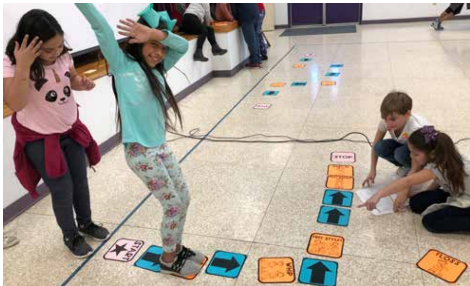
STEAM Team students worked to create a game code to move from one point to another.

Physical Education students at Lamar Elementary are having a blast with yoga and learning about all of its benefits. Yoga enhances strength, coordination and flexibility. It encourages body awareness and self-esteem. Most importantly it reduces anxiety and stress because it promotes a sense of calmness. Our students are getting ready for our upcoming STAAR testing by learning breathing and calming techniques that will help them with clearing the mind when testing time comes around.