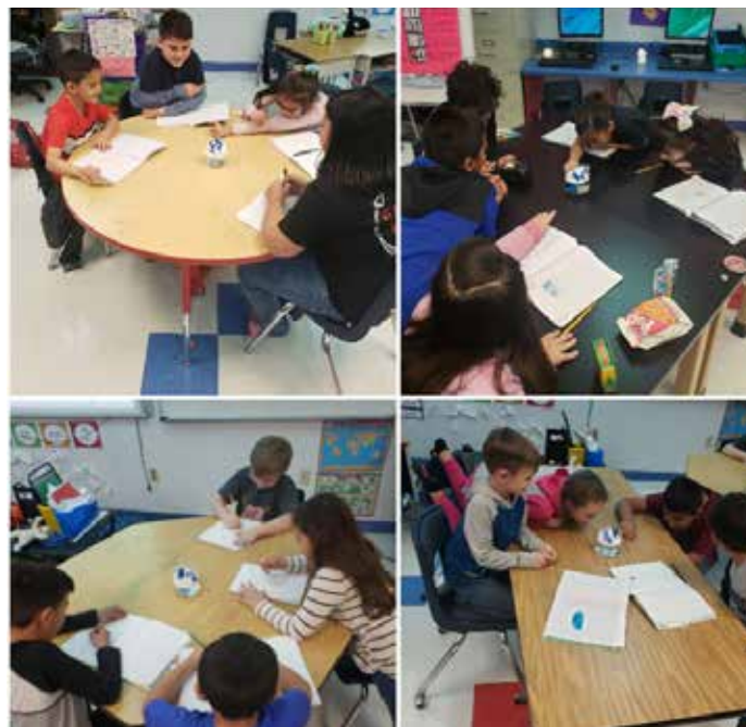
Students from Mrs. Duran's 2nd grade participated in a water cycle class experiment to discover the answer to the question: How do clouds form?