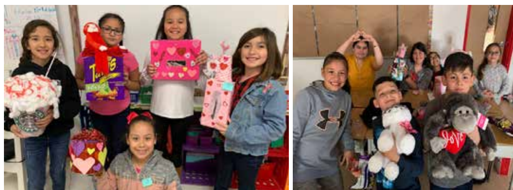
NHE students wishing everyone a happy Valentine's Day filled with friendship, kindness, and happiness.