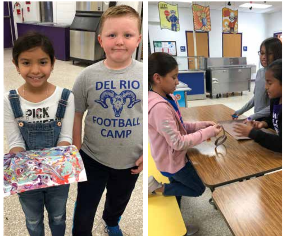
Ebru art is a popular technique in Turkey and Central Asia.