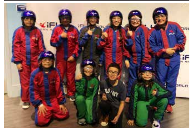
Garfield 5th grade GT students attended iFLY in San Antonio for the day. What a great experience!