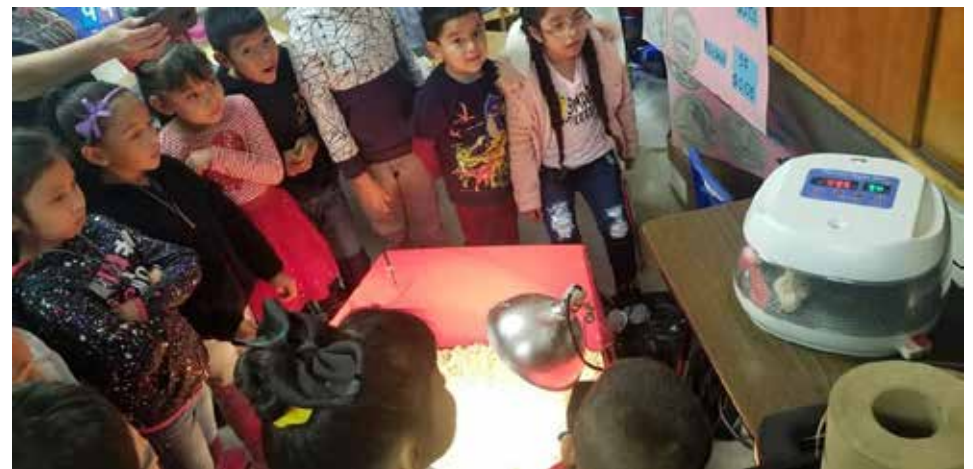
All 1st grade classes had baby chicks through Texas A&M AgriLife. Students were able to watch the entire process of incubation and hatching. They were very excited to see the babies finally hatch!!