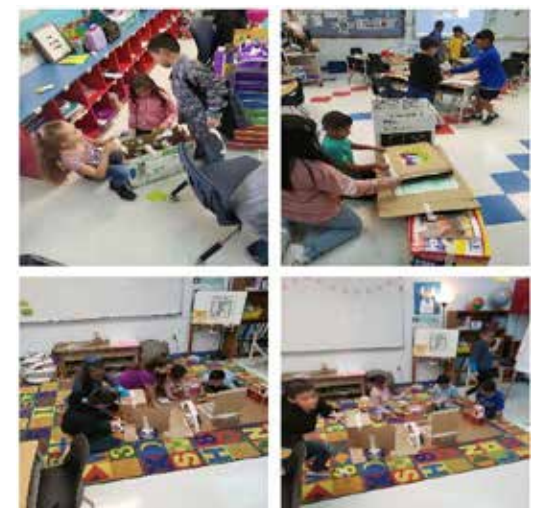
2nd Graders class exploring urban, suburban, and rural communities.