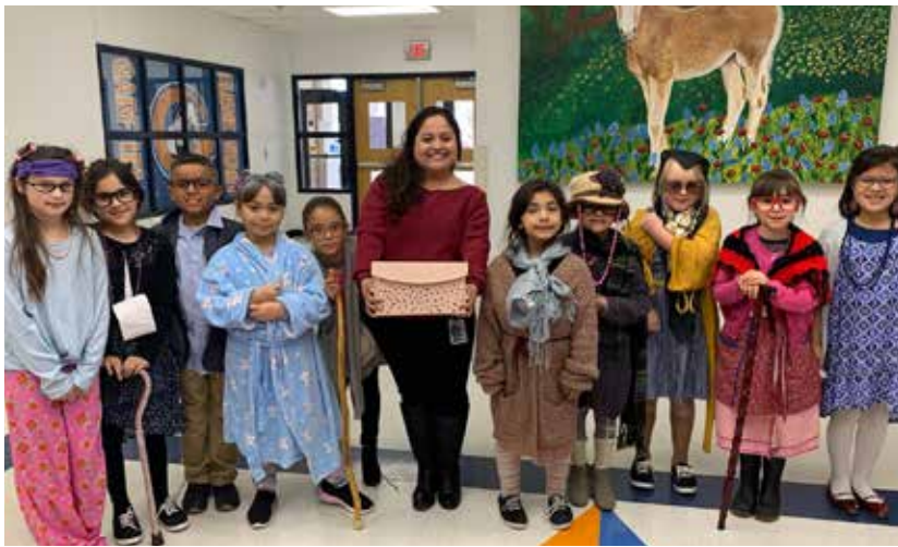
Second grade students celebrated the 100th day of school by dressing up like they were 100 years old. These students also presented Ms. Cienega with a present for Counselor's Week!!!