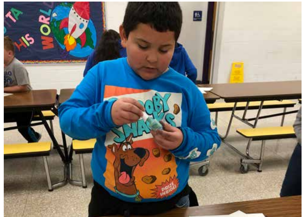
Students create an Ebru inspired art piece.