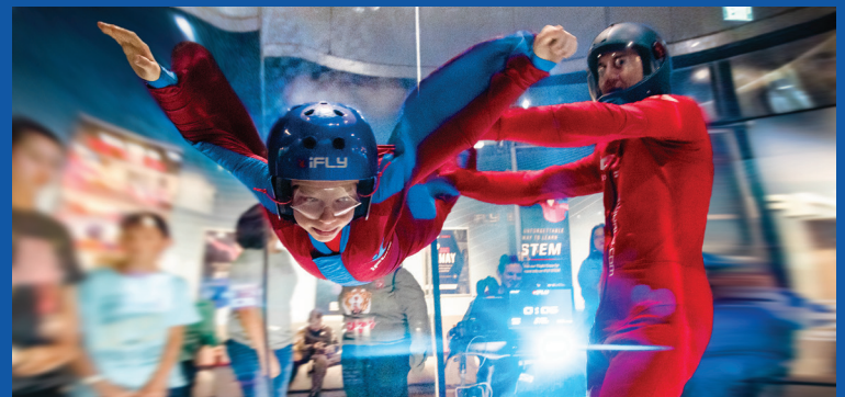
Gifted & Talented

The state's goal for G/T students is to ensure that those students who participate in G/T services demonstrate skills in self-directed learning, thinking, research, and communication. Students receive G/T services in the regular classroom setting by teachers who have met 30 hours of state-required training and who have completed applicable G/T certification requirements as delineated in TAC §89.2(1). SFDR CISD offers G/T and advanced-level students an array of opportunities to collaborate as a group with other students or develop independently commensurate with their abilities and emphasizes content in the four foundation curricular areas. (TAC §89.3(1) and (3); State Plan 2.1C)