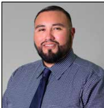
Luis Esparza Del Rio Middle School