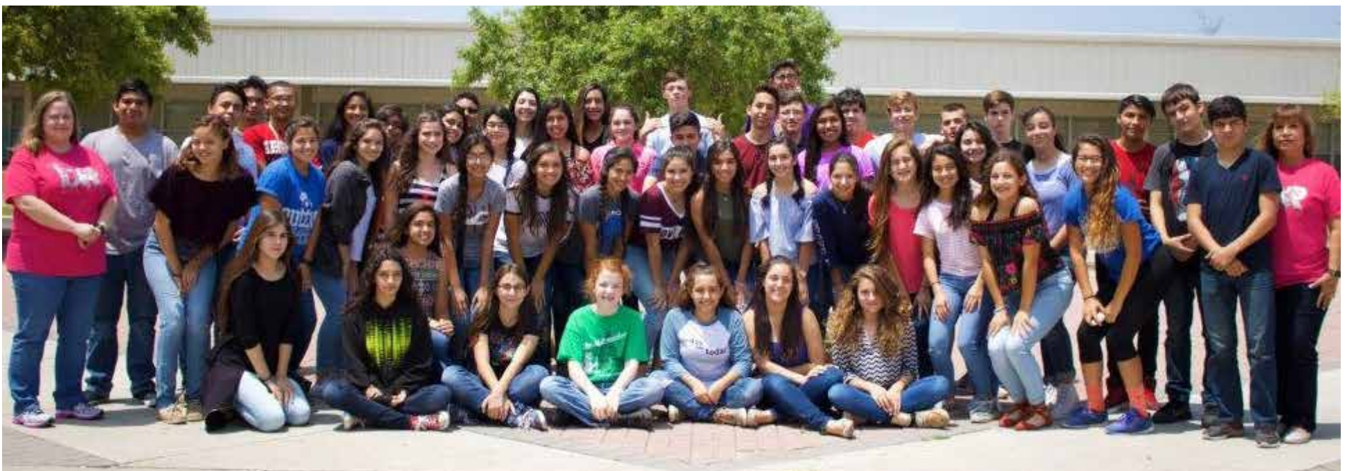
Creative Communications has helped to inspire, motivate, and encourage student writers with their national writing contests. The top entries nationwide are published in a hardcover anthology that will record the creative insights of today's student writers. This is not a contest that publishes every entry. So, it is an honor to be accepted and published in the book.