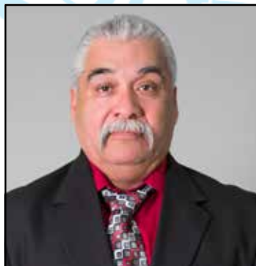
Glafiro Santellanes Del Rio Freshman School